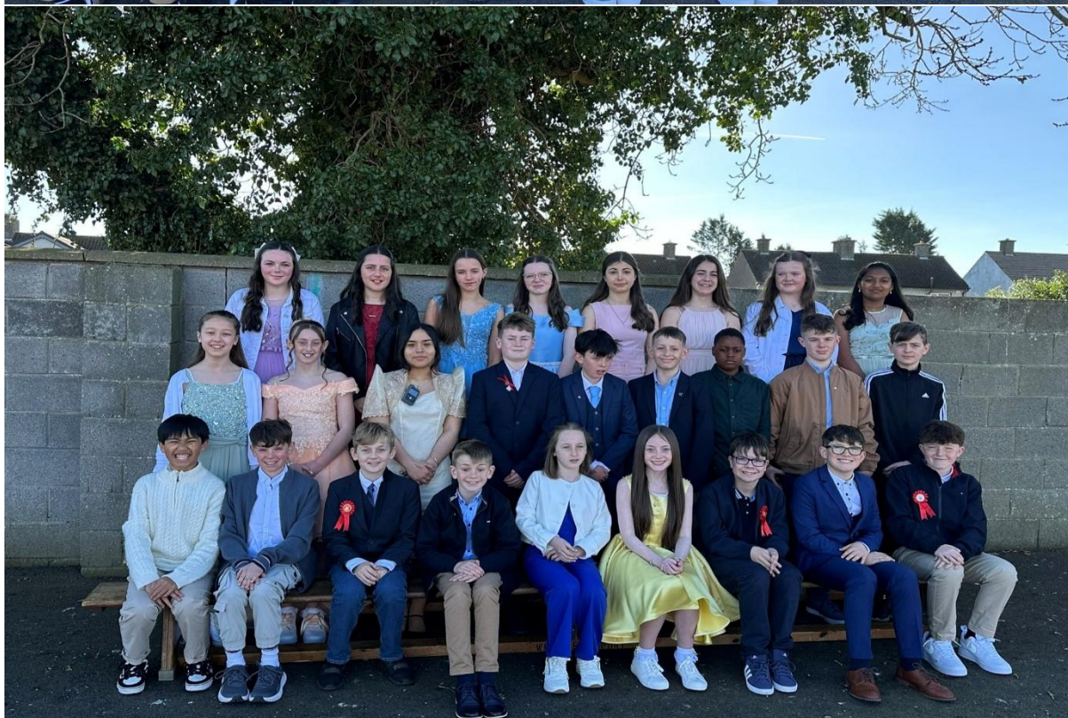
The pupils of St. Joseph's celebrated their confirmation on the 22 nd March in St. Coca's church. They were a credit to their parents and teachers. We know they will let their light